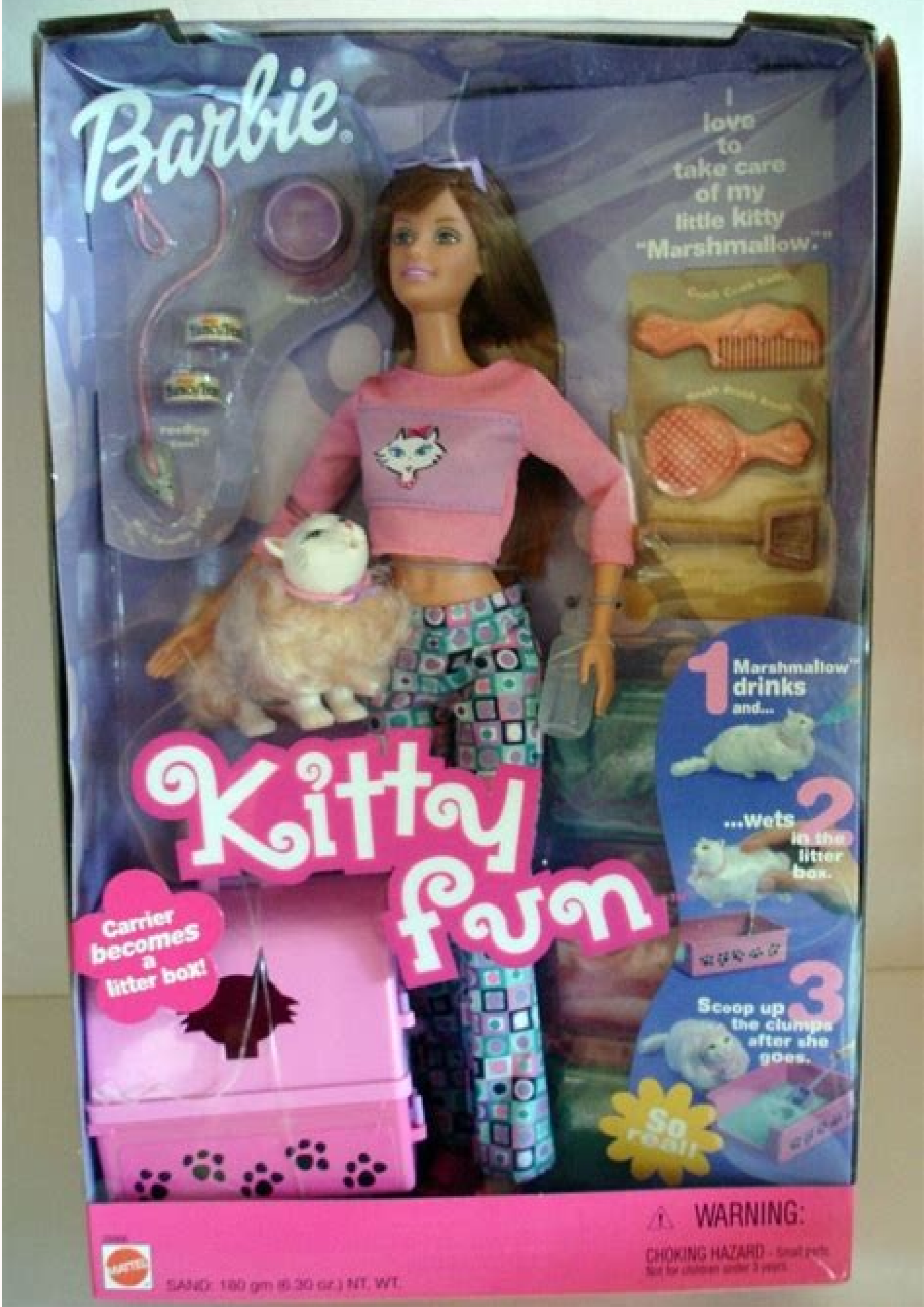
Vintage barbie box value. Are old barbies worth money. What vintage barbies are worth money. Most valuable vintage barbies.